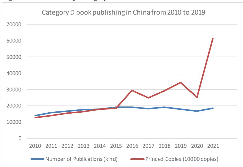
Figure 2 Publication of Category D Books in China 11